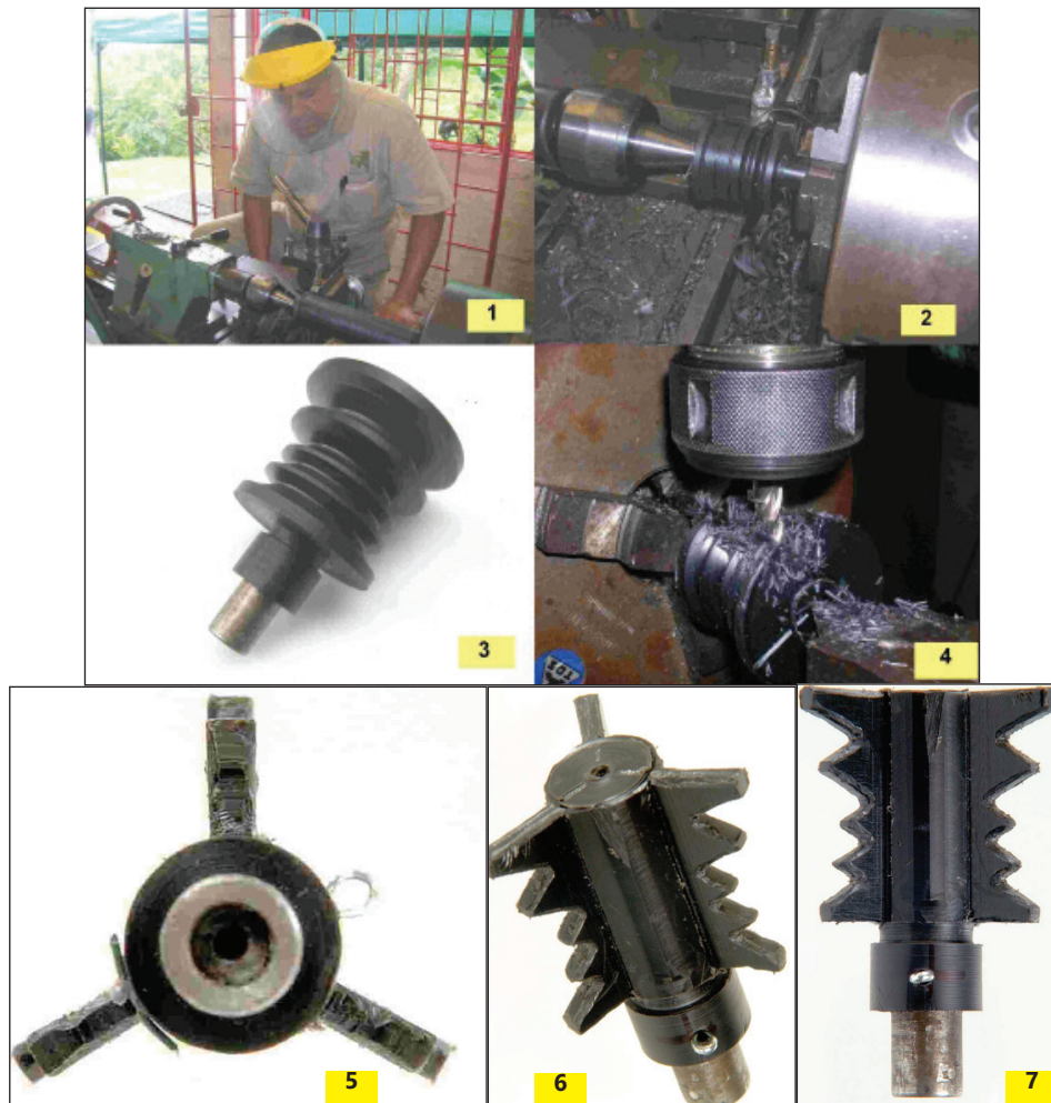
Figure 4. Construction of the beater with three toothed blades and the final product for be used in a portable coffee harvesting tool. The stages were: machining the Prolon bar (1); lathing the beater (2); coupling the shaft to the motor (3); milling each beater (4); top view (5); isometric of final product (6) and frontal view (7).