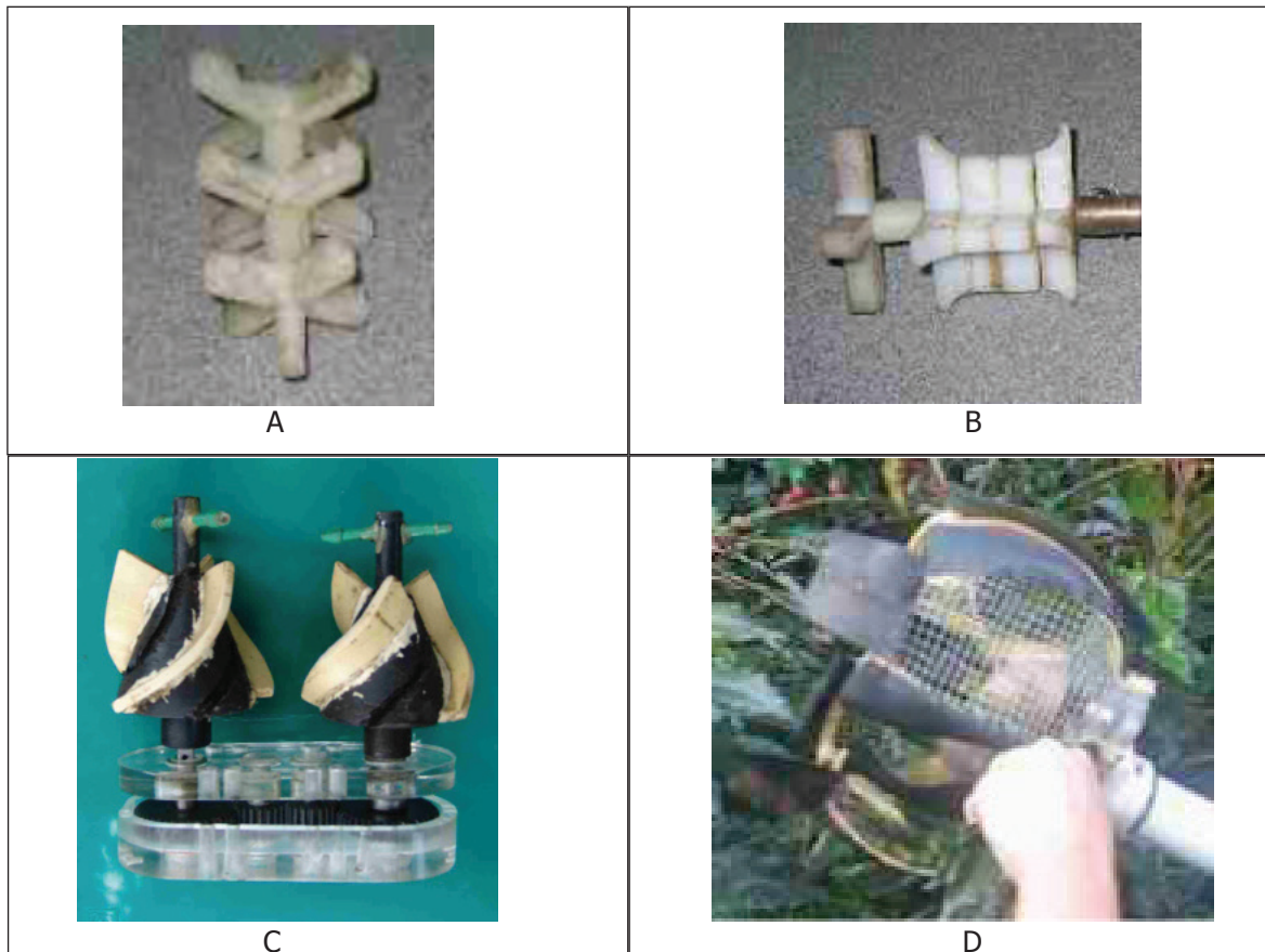
Figure 1. Beaters evaluated for the detachment of coffee berries with the ALFA tool. Phase I. Beater I (A); beater II (B) and helical beater (C and D).

The evaluated beater had two sections; one for mass detachments and one for selective detachment. The former had a truncated cone shape with a set of three helical blades. The latter had a circular