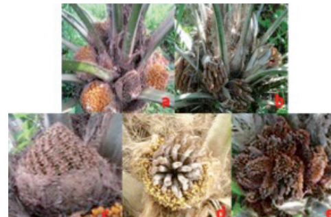
Figure 1. Growth and emergence of the inflorescence. a). American oil palm in female cycle. b). American oil palm in male cycle. c). Normal inflorescence. d). Hermaphrodite inflorescence. e). Androgynous inflorescence.

no & Romero, 2015). In this research, only 5.3% of the evaluated population perform this trait (Prolificacy). It is important to note that the type of inflorescences obtained in this research, only 6.4% of the hermaphrodite population inflorescences performed in 22% of the 59 accessions. (Figure 1). A quality highlight of the collection is the absence of palms with androgynous inflorescence (having male and female flowers in distinct parts of the same inflorescence). (Tables 1 and 2).