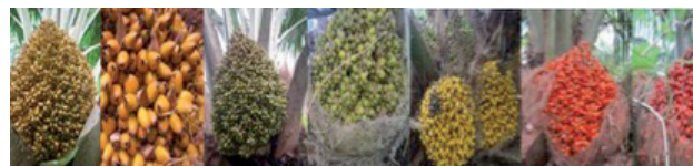
Figure 5. Fruit and fruit bunch ripening stage of Noli palm. a). Immature fruit yellow color. b). Immature fruit mustard yellow color. c). Immature fruit green color. d). Immature fruit green- yellow color. e). Ripening yellow color of Noli palm fruit. f). Ripening red-orange color of Noli palm fruit. g). Ripening red color of Noli palm fruit