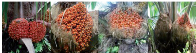
Figure 4. Fruit and fruit bunch development and growth stage of Nolí palm. a). Prolificacy of Nolí palm: two inflorescences on leaf axil. b). Normal: one inflorescences per leaf axil. c). 50% of fibers in cluster formed. d). 50% of fibers in cluster formed

Group 4: This group represents one obtained accession by controlled crossing among selected palms in cross-pollination populations in full plant breeding program. The American oil palms of this accession, in unripening fruit stage, produce fruit bunches with green color (100%), which become yellow (100%) at total fruit ripening stage. In addition, the American oil palms of groups 1 and 2, emit low-fiber female inflorescences around, only covers 25% of the inflorescence, 11.1% had hermaphrodite inflorescences. (Figure 4).