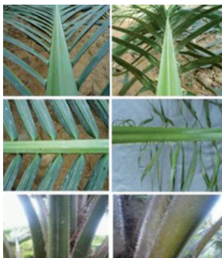
Figure 3. Leaflets and petiole disposition of the Noli palm. a). Leaflets (leaf 17) inserted on a single plane. b). Leaflets (leaf 17) inserted on several planes. c). Green color pulvinules. d) Yellow color pulvinules. e). Green color petioles (leaf 17). f). Yellow color petioles (leaf 17)