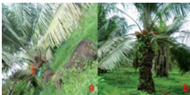
Figure 2. Stem elongation of Noli palm. a). American oil palm with prostrate stem. b). American oil palm with columnar stem

Given these concerns, 86.6% of the plants had female inflorescence cycle (97.3%) and is generally considered to indicate the ability to perform a prostrate stem, normal phenomenon in this species. (Figure 2). In addition, the leaflets of E. oleifera species are regularly distributed along the rachis and inserted on a single plane, opposite to the insertion of the leaflets of the palms of the E. guineensis species, which are inserted at several planes (Corley & Tinker, 2003; Moreno & Romero, 2015). (Table 1, Figure 3). Petioles and leaves performed green pulvinules, which is an indicator of the low variability of the work collection, in these and other traits, while recognizing different states of green color, may indicate a nutritional deficiency. In the E. guineensis species, variations occur in these traits ranging from green to bright yellow (Corley & Tinker, 2003; Moreno & Romero, 2015) (Figures 4,5). Finally, the presence of Cercospora sp. widely distributed in all palms collection, was only identified in lower leaves, those already fulfilled their mission to feed and sustain a fruit bunch, and were also close to the artificial pruning, which is established once or twice a year. (Figure 6).