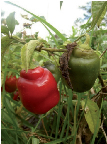
Figure 1. The intense red color in rocoto pepper fruits. Evidence of physiological maturation stage.

To guaranteed seed extraction, longitudinal cuts were made on fruits using surgical masks and latex gloves (Pacheco & Zuñiga, 2007). Seed disinfection was performed by seed washing with hypochlorite water solution at concentration of 5% v/v, followed by two washes with deionized water. Subsequently, seeds were dried at room temperature for one day.