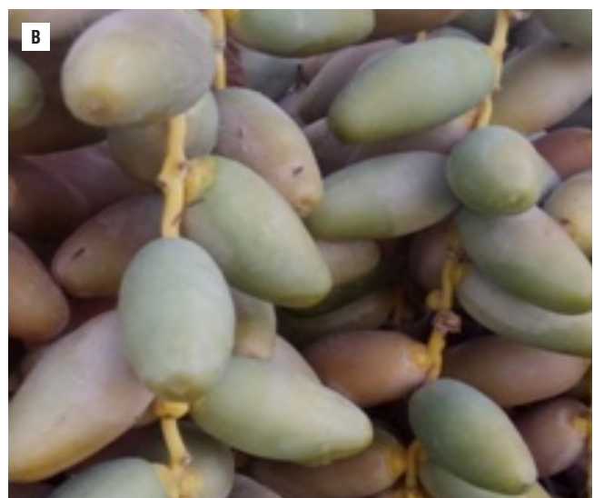
FIGURE 2. Infested dates A) before treatment, B) three days after treatment.