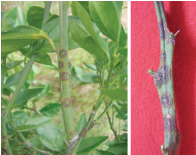
FIGURE 2. Symptoms of leprosis in Valencia orange branches. Meta and Casanare, Colombia. Left: initial state. Right: advanced.

means it does not spread through the plant (Kitajima et al. , 2003). When the inoculum and virus vector are present in the field and there is no control, the entire cultivation could be contaminated in two or three years Rodrigues et al. (2001). Therefore, most leprosis control studies are focused on vector management (Alves et al. , 2005). Lesions grow 5 to 7 mm in diameter every 15-20 d. When the severity is greater than 30%, affected leaf drop occurs on average 70 d after onset of the first lesion (León et al. 2006).