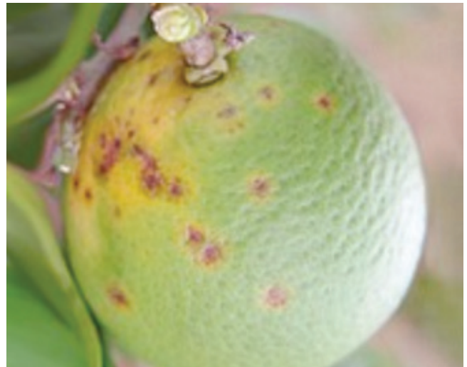
FIGURE 3. Symptoms of leprosis in 'Valencia' orange fruit. Meta, Colombia. Left: initial state. Right: advanced symptoms.