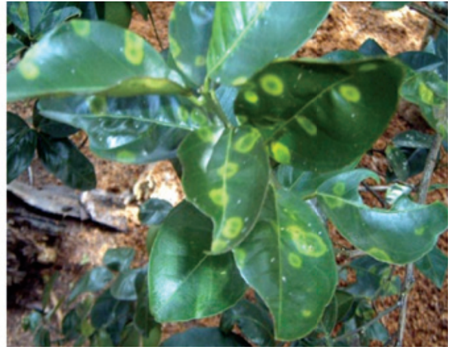
FIGURE 1. Typical initial leprosis symptoms in orange leaves. Meta and Casanare, Colombia.