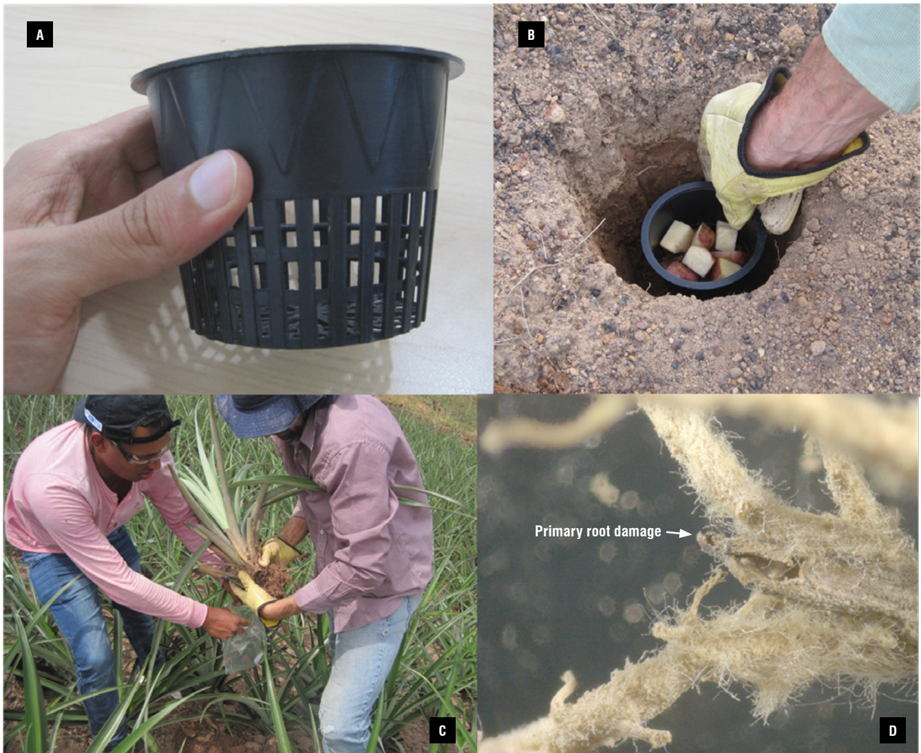
FIGURE 1. Symphylid sampling methodology. A) PVC plastic container used for sampling. B) Container with 50 grams of potato used as bait. C) Collection of plants. D) Bifurcation in the roots caused by symphylid damage.

The traps were transferred to the laboratory of La Suiza Research Center of the Colombian Agricultural Research Corporation - AGROSAVIA. There, they were thoroughly checked, spreading the soil and the bait in a dark-colored plastic tray where the captured specimens were collected with brushes and deposited in 75% ethyl alcohol.