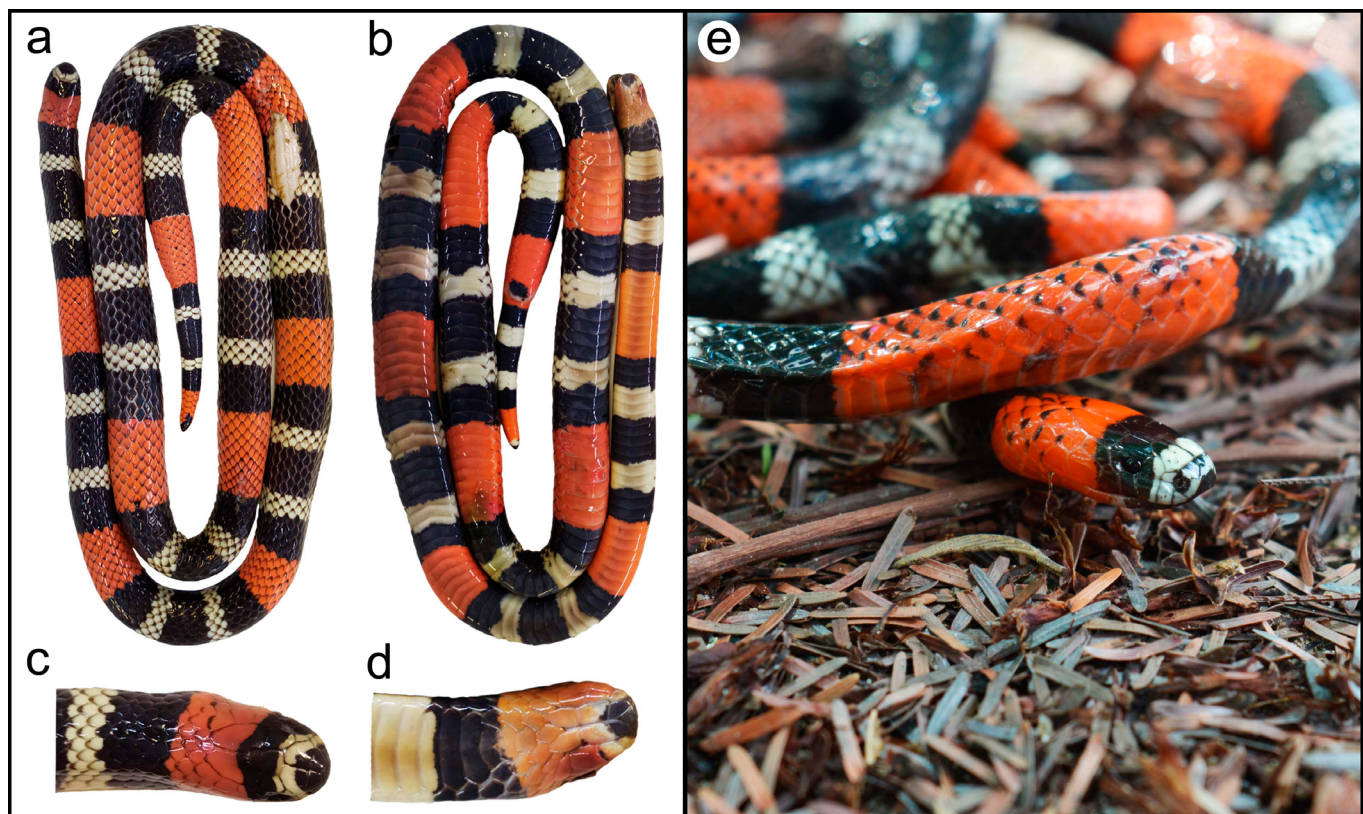
Figure 1. Comparison of the similar, co-occurring coral snakes Micrurus lemniscatus and M. ibiboboca . a-b. Body dorsal and ventral view, and c-d. head dorsal and ventral view of M. lemniscatus specimen CBPII-242 and e. head/body of live M. ibiboboca from the municipality of Pedro II, Piauí State, Brazil. Note the difference in snout tip coloration.

We identified the specimen using Pires et al. (2021), with later confirmation by N. J. Silva Jr., based on the presence of the following characters: 232 ventral scales; 24 subcaudal scales; ten body triads; one tail triad; snout black (rostral, internasals, first supralabial, and anterior portion of nasal scales); white transverse band passes through the posterior region of the nasal scales and second supralabial, reaching the anterior portion of the frontal and supraocular; gular region red; black triangular mark extends from mental scale to the first infralabial to the anterior portion of the anterior genial. Among coral snakes, only M. ibibob-