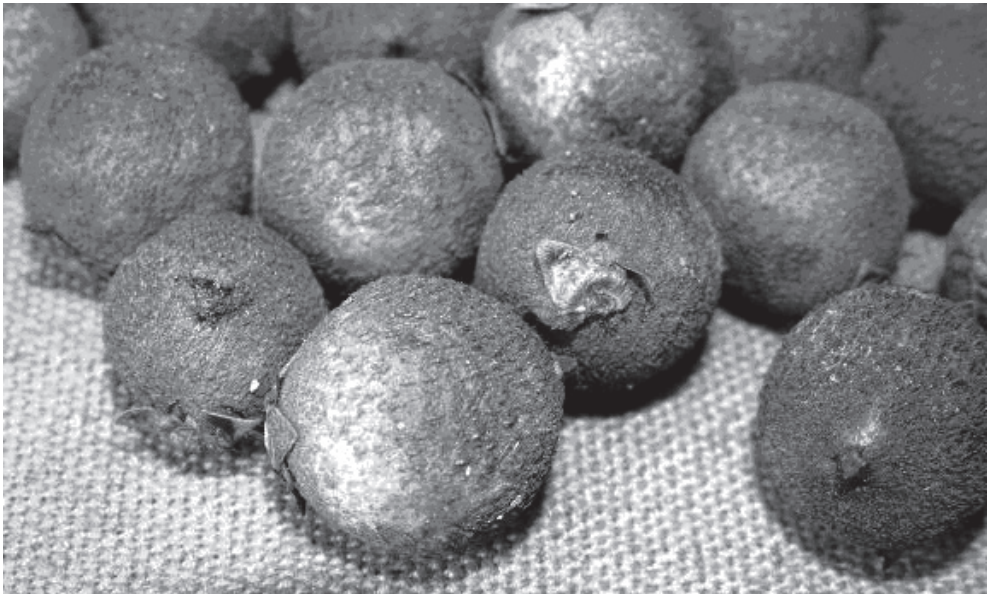
Figure 4. Fruits of Aiphanes killipii (R. Bernal 3433, COL).