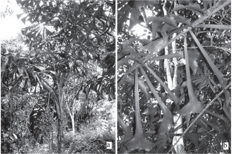
Figure 3. Aiphanes killipii . a, habit; b, detail of leaves. Colombia, Santander.