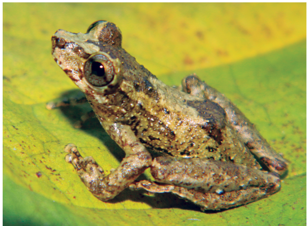
Figure 1. Individual of Ololygon trapicheiroi (Male, SVL 25.15 mm, MZUFV 18464) from Municipality of Passa Vinte, Minas Gerais state, Brazil.

Compiling data from museums, SpeciesLink, and field sampling, we present twenty-three new records of distribution for O. trapicheiroi and provide a current distribution map, including sites in the Minas Gerais, São Paulo and Rio de Janeiro states (Annex 1 in supplementary material).