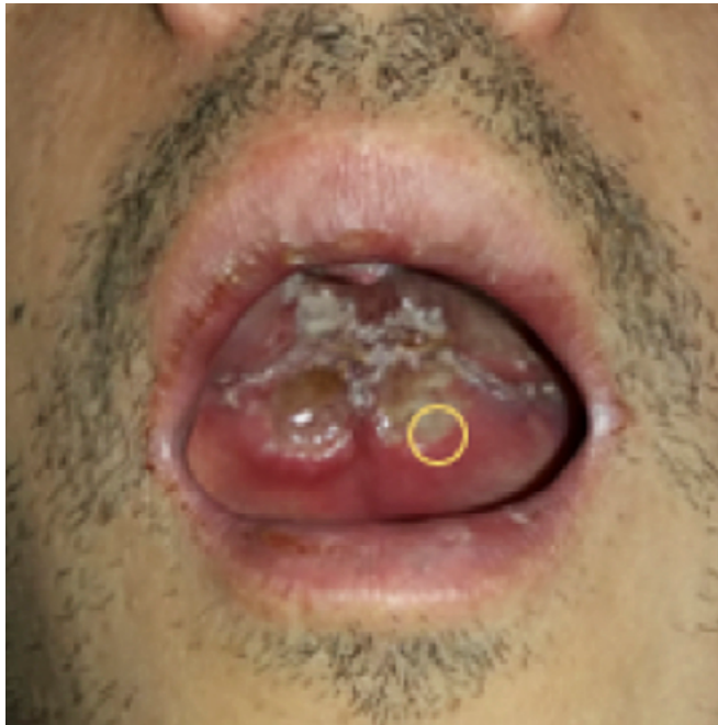
Figure 1. Ulcerated lesion in hard palate with necrotic borders.

Circle: Delimitation of the site of the biopsy.