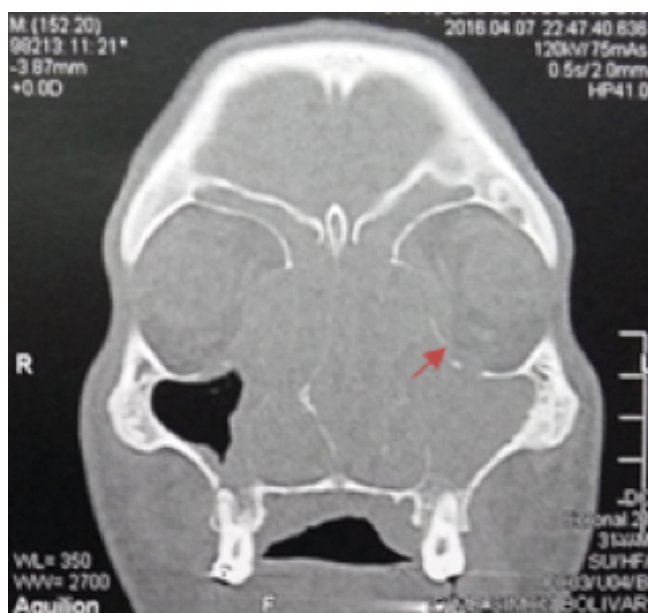
Figure 2. CT scan of nose and paranasal sinuses. Coronal view: complete occupation of left maxillary sinus, frontal and bilateral ethmoidal sinuses. Arrow: Eroded left lamina papyracea.

neous soft tissue density material; left lamina papyracea was eroded and the periorbital fat had inflammatory changes (Figure 2). Lymph nodes of the neck were compromised at zones IIa y IIb. The upper airway was patent. No lesions were identified in CT scans of thorax and abdomen. The patient was hospitalized and multiple punch biopsies of the soft palate were taken.