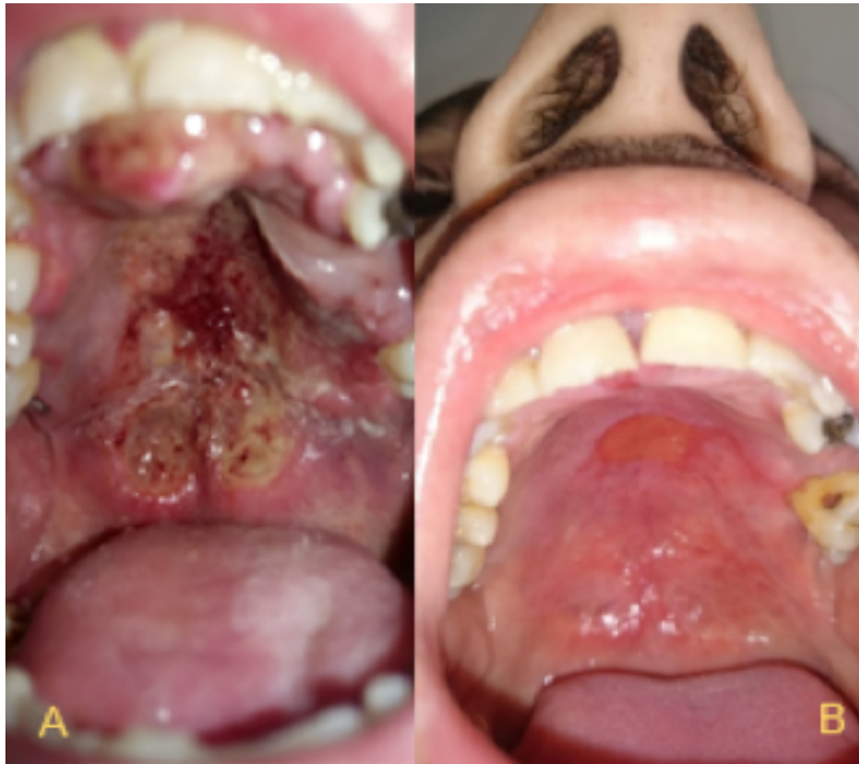
Figure 4. A. Initial lesion in the palate. B. 7 months after SMILE protocol chemotherapy.

with recurrent bacterial sinusitis (5,6). As the disease progresses, a unilateral collapse of the nasal cavity and oronasal fistula may appear due to edema, necrosis and major destruction of the tissue in the facial midline (6). Cutaneous manifestations have the highest prevalence among systemic symptoms.