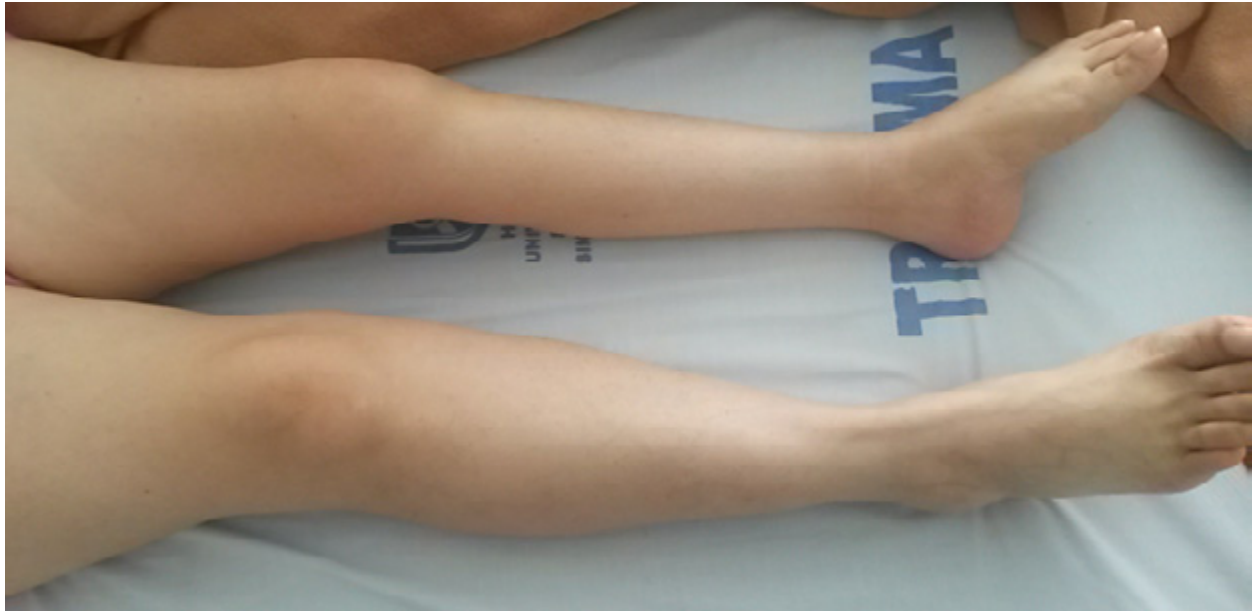
Figure 1. Significant atrophy of the left lower limb.

reflexes. On admission to the emergency service, a foreign body sensation was reported in the right dorsal region, possibly associated with the history of arthrodesis.