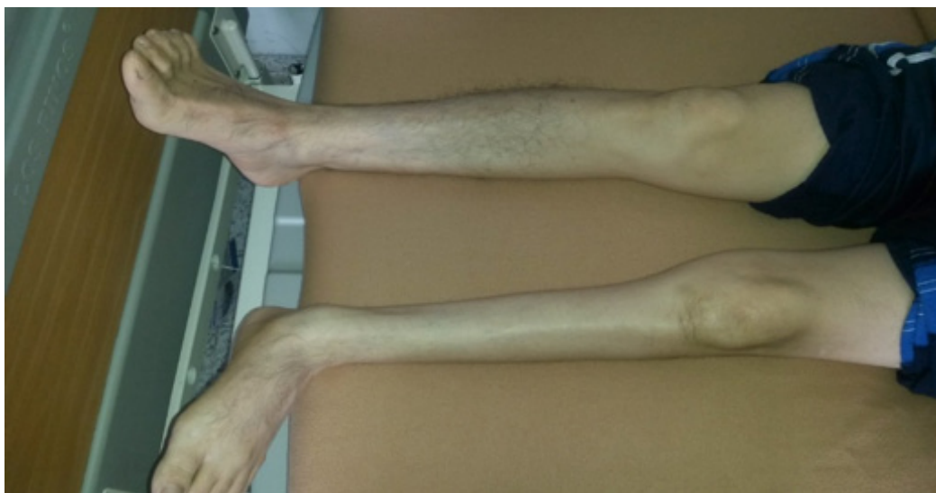
Figure 3. Significant atrophy of the left lower limb.

not performed, clinical differential diagnoses, such as a lumbar hernia, were ruled out through spinal magnetic resonance, which in turn ruled out nerve root compression.