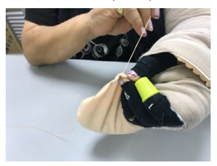
Figure 4. Manual task.

carried out in shorter times and the elements were distributed in a work plane as required by the person herself for better performance. As these tasks were related to her likes and interests, manipulation, coordination and efficiency were evident in each sensorimotor process performed.