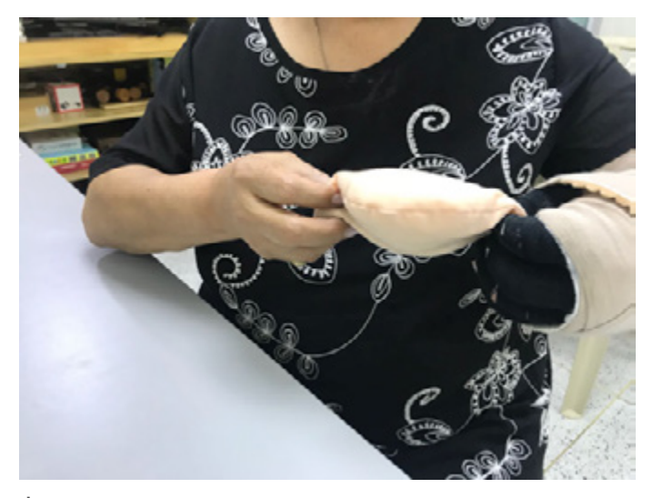
Figure 3. Explanatory task.

Throughout the sessions, an increase in the amplitude of the range of motion expressed by the person in relation to her activities of daily living was observed in activities such as reaching objects located at the top of the