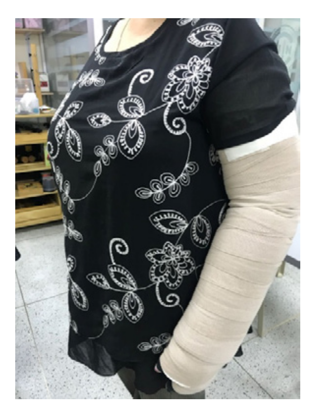
Figure 1. Final result and person