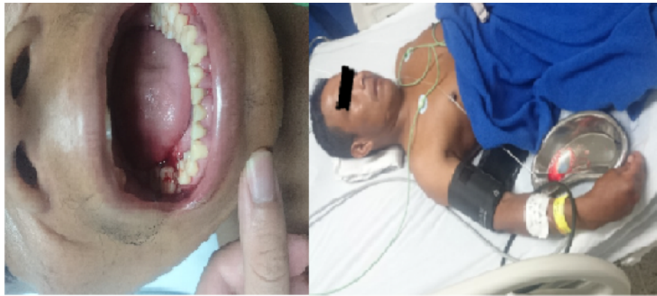
Figure 3. Bleeding of the gums.

Finally, two episodes of hematemesis occurred during hospitalization, for which hematology tests and blood chemistry were requested. Table 2 presents the results of the laboratory tests carried out on admission, revealing an increase in kidney function and alteration of liver function; deterioration of leukocyte and platelet function is also evident.