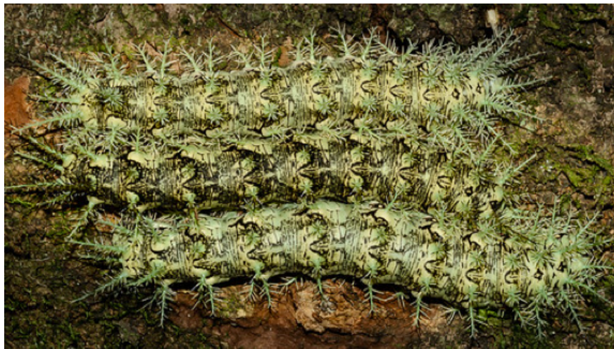
Figure 1. Lonomia obliqua larva.

The caterpillars of the Saturniidae species (Figure 1) are characterized by pointed and branched spicules, bristles or hairs that contain a complex mixture of enzymes and toxins. (3) These substances are released into the skin after contact, causing activation of the kinin–kallikrein system and fibrinogen-lytic enzymes that produce a wide arrange of signs and symptoms because of the alteration in the coagulation cascade involving factors VIII-XIII-X. (3,4) Authors have reported cases of caterpillar poisoning that start with multiple symptoms at the inoculation site and then progress to general symptoms. Initial symptoms include general malaise, headache and nausea, followed by hemorrhagic syndrome, which leads to multiple organ failure and even death. (5)