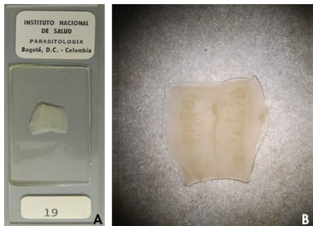
Figure 1. Proglottid found in the patient feces. A) Proglottid of Taenia saginata ; B) Proglottid of Taenia saginata .

Direct wet mounts and formol-ether concentration technique were performed. Following the standard routine, proglottids were washed with distilled water, fixed in 10% neutral buffered formalin, and stored at room temperature until histological processing; then uterine branches were counted under a light microscope at a magnification of 40×. Upon examination, proglottids were found and later identified as T. saginata (Figures 1 and 2). Proglottid morphology was of approximately 11 mm in length and 8 mm wide, and the received segment had around 18 uterine branches. Eggs were roughly 33 micrometers in diameter.