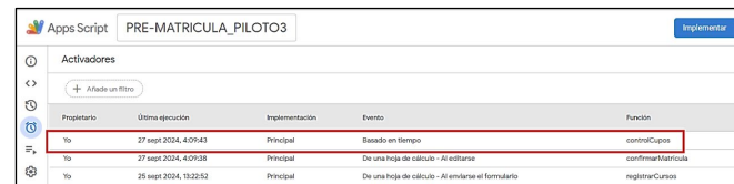
Figure 3 - Configuration of the event quota control every one minute