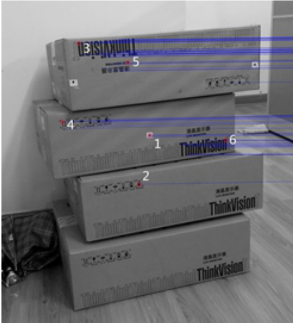
Figure 4. Six object points are selected for validating the accuracy of relative orientation.

For validating and assessing the accuracy of the result of relative orientation, the six object points (p1, p2, p3, p4, p5, p6) are selected and used to calculate the space coordinate basing on the image space coordinate of the left picture. The selected six object points are illustrated in Figure 4.