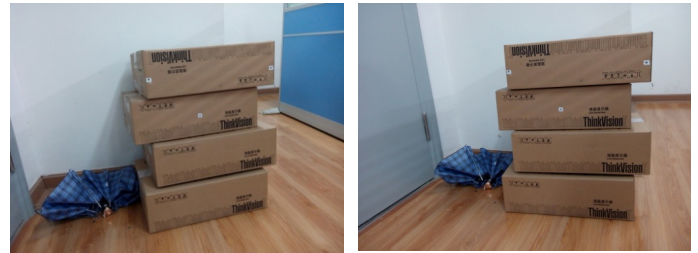
Figure 2. The stereo images are taken by the same camera. The first image above is taken from the left then the other is on the right.

The indoor close range images with large oblique angles are used for experiments to validate the correctness and accuracy of the proposed new model of direct relative orientation with seven constraints. The stereo image pair was acquired by a non-calibrated Sony IMX135 camera with a pixel size of 1.12 \mu m which is shown in Figure (2). The numerous conjugate points from the left and right image were detected using SURF match model, and the error match points were removed to obtain the reliable relative orientation results as is shown in Figure 3. From the 62 high-precision matched points, the six conjugate points were selected and used to validate the model correctness and assess the result accuracy of the relative orientation. The baseline length was measured as 0.55m.