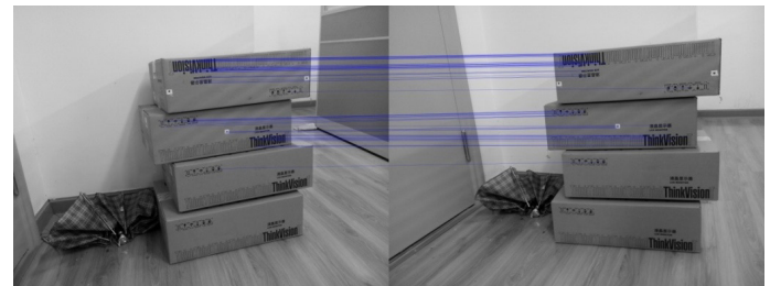
Figure 3. The result of feature point detected on the stereo pair.

The experiment includes the follow procedures. 1) The 62 conjugate points were used to calculate the parameters of the relative orientation of the stereo image pair. 2) Basing on the image space coordinate of the left image, the space coordinate of the object points corresponding to the selected six conjugate points were calculated using the result of the relative orientation and the forward intersection in photogrammetry. 3) The six object points were linked to 15 line segments during permutation and combination, and the distances of the 15 line segments were accurately measured as a real value. 4) To validate and assess the accuracy of the result of relative orientation, the distances of the 15 line segments were calculated using the space coordinate of the six object points, and compared with the measured true value. Then, the accuracy is assessed with the standard deviation.