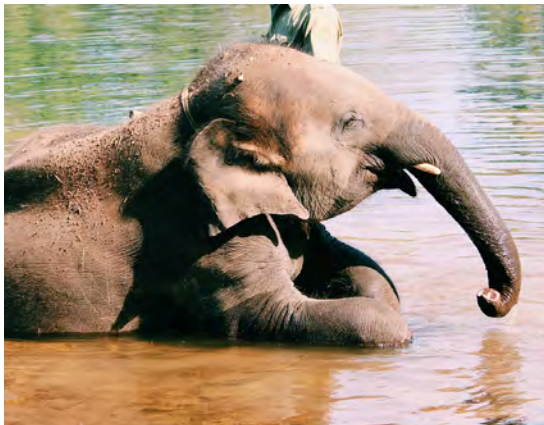
The elephant is sitting _____ the water.