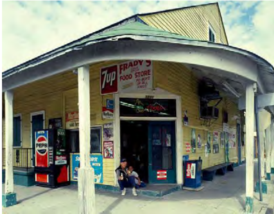
The store is located _____ corner.

on between under in front of over with in on top of toward