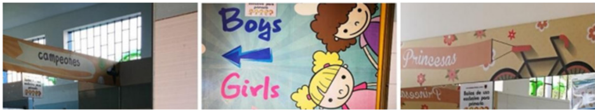
Figure 1. Segregation Practices at School: Mapping Gender Division

Note. Campeones = champions; Princesas = princesses