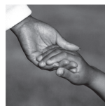
Figure 1. The Situation of English Language Teaching in Colombia

Specialized language teachers to support English in primary grades have disappeared from the public schools.