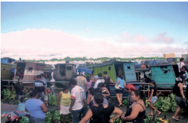
Figure 2. Concentration of Peruvian boats moored in the “border” of Tabatinga-AM.

Monday, according to the account of the vendor A, is the day that the Israelites sell their products in Tabatinga. Commercialization (figure 2) starts early in the morning, until the products are totally sold. The commercialization of poultry, live chickens and roosters, enabled us to collect weight and price samples, which resulted in an average amount charged per kilo of birds. This procedure was necessary because live poultry is normally sold in units, that is, each bird has a stipulated price, which will vary according to the size and body characteristics. The price is made “by the eye”, as stated by the sellers.