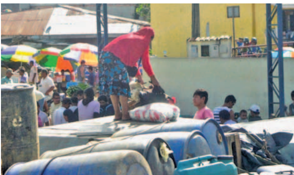
Figure 4. “Israelite” Woman transporting backyard hens or “pollo criollo” as it is usually called.

Another product that acts as possible substitute for the industrialized / frozen chicken and has an attractive distinctive flavor and is a healthier product according to consumers is the backyard raised hens. In both places visited, we could identify the “borders” of cities and farms in the commercialization of free range chickens, backyard hens and roosters for fighting. As previously reported, the sale of chickens and roosters by the “Israelites” (figure 4) is very dynamic, and involves ordinary consumers seeking a chicken with the best price and also middlemen who buy chicken to resell earning at least R $ 5.00 Reales per unit.