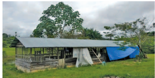
Figure 3. Shed for raising farm chicken in Benjamin Constant.

According to local producers, for every hundred chicks at least twelve food sacks of various types are consumed on average, in a process that lasts forty-five days; at the end of that period the bird is ready to be harvested and sold to the consumer. According to information obtained from producers if there is no demand for the birds, these are fed with wheat bran (farelo de trigo) until there is a demand and the slaughtering is performed. Wheat bran according to the producers ensures that the bird food will result in a flavor similar to the purely free-range chicken (figure 3).