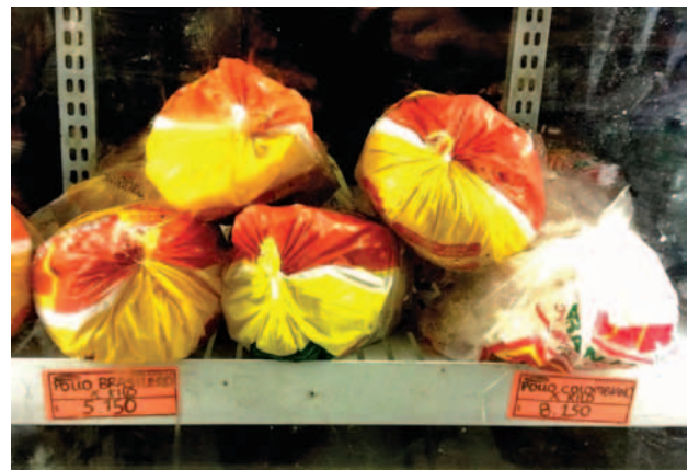
Figure 6. Brazilian frozen chicken and Colombian side by side in Leticia supermarket.

Colombian supermarkets visited, especially in the city of Leticia, sell the Brazilian industrialized-frozen chicken, alongside the sale of Colombian chicken (figure 6), but with a clear distinction between products. The Brazilian industrialized-frozen chicken, despite being cheaper, is taxed as an unhealthy product, containing hormones that affect health, contrary to Colombian chicken, which is sold by traders as a free range product free of hormones and medications, but with a higher price, which in fact leads to strong demand for Brazilian chicken.