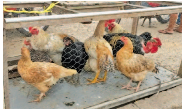
Figure 5. Commercialization of hens and cocks in the external part of the Municipal Market of Tabatinga.

In the cities studied, there are few chicken farmers that produce and commercialize in an organized format. Producers visited work with regional chicken production parallel to the laying hens, and initially the creation of free-range chickens is focused on the family’s own supply, then the production surplus is sold to neighbors or relatives. Many have found this activity an opportunity to achieve economic success, so investing resources in adapting their backyards into areas aimed at creating free-range chickens such as fencing and building chicken coops in an amateur way is usually the procedure. The commercialization can happen at the producer home-farm or in more established places such as the local market and fairs (figure 5).