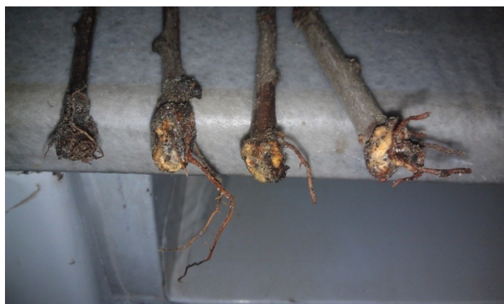
Figure 3. GF677 semi-hardwood cuttings three months after treatment of 2000 mg L -1 IBA+3% H 2 O 2 in March.

The application of IBA, Put and H 2 O 2 treatments and their interactions on root number were highly significant ( P \leq 0.01 ). The highest root number (46.3) was observed in 2000 mg L -1 IBA+3200 mg L -1 Put, 2000 mg L -1 IBA+800 mg L -1 Put, 3000 mg L -1 IBA+800 mg L -1 Put, 1000 mg L -1 IBA+800 mg L -1 Put and 1000 mg L -1 IBA+3200 mg L -1 Put treatments. The lowest number of roots was recorded for control and 1600 and 3200 mg L -1 Put, while they did not have significant differences with 1.5 and 3% H 2 O 2 and 3000 mg L -1 IBA treatments (Table 2). The study showed that Put had some effects on root formation and its growth. Data on length and dry weight of roots illustrated that application of Put in the rooting of GF677 resulted in better quality roots compared with IBA treated cuttings. Moreover, concentrations of 800 and 1600 mg L -1 Put were better than its higher concentration