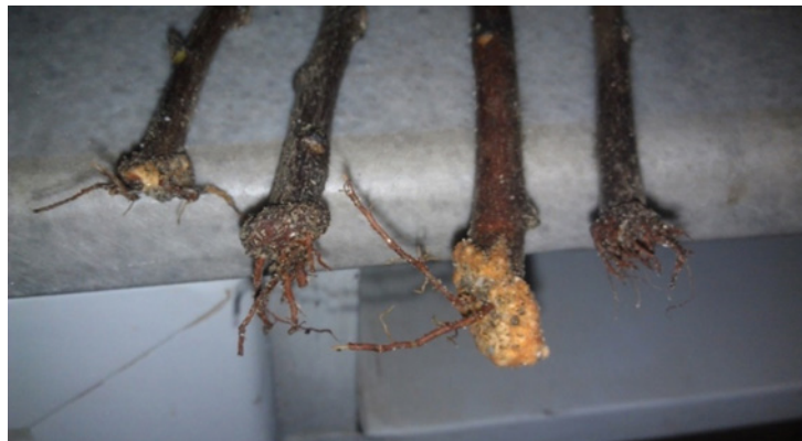
Figure 2. GF677 semi-hardwood cuttings three months after treatment of 2000 mg L -1 IBA+3200 mg L -1 Put in March.