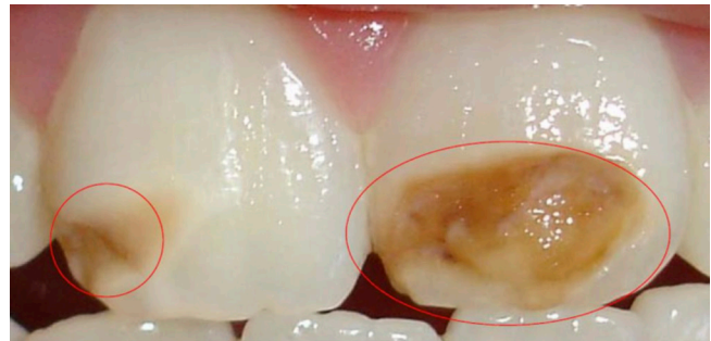
Figure 3. Enamel hypoplasia in permanent maxillary incisors.

Hypoplasia was characterized by enamel thickness reduction, and the combination of defects was related to teeth showing the two defects, hypoplasia, and opacities in the same surface (Figure 3).