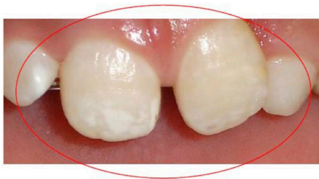
Figure 1. Diffuse opacity affecting the permanent maxillary incisors.

Defects were classified according to the DDE index (14) in three categories: hypoplasia, demarcated opacities and diffuse opacities. Diffuse opacities presented with normal thickness of the affected enamel, translucence abnormalities, and undefined limits (Figure 1).