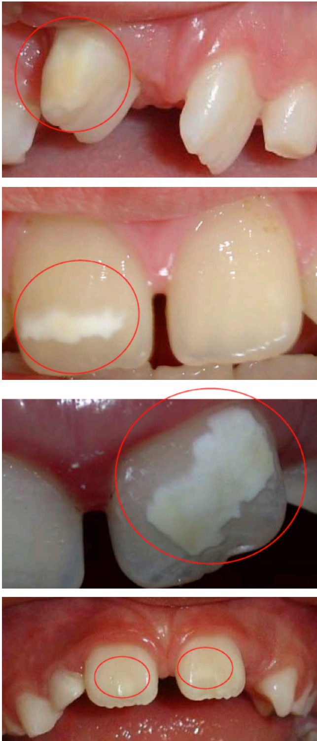
Figure 2. Demarcated opacities affecting the permanent maxillary incisors.

Demarcated opacities showed staining ranging from white, cream, yellow to brown bordered with the adjacent enamel (Figure 2).