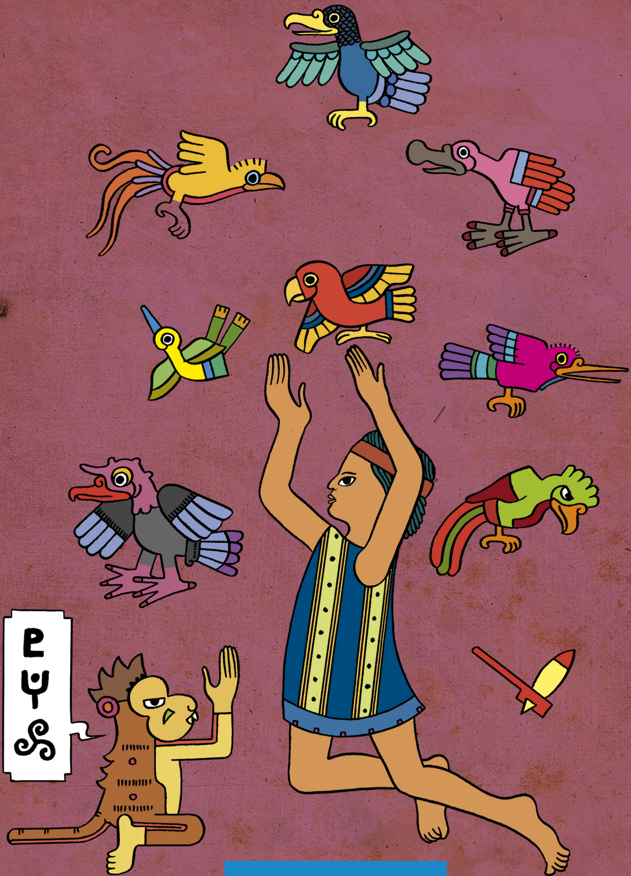
IVÁN "IVANQUIO" BENAVIDES "El niño vacío" – 007 TÉCNICA: TINTA, COLOR DIGITAL