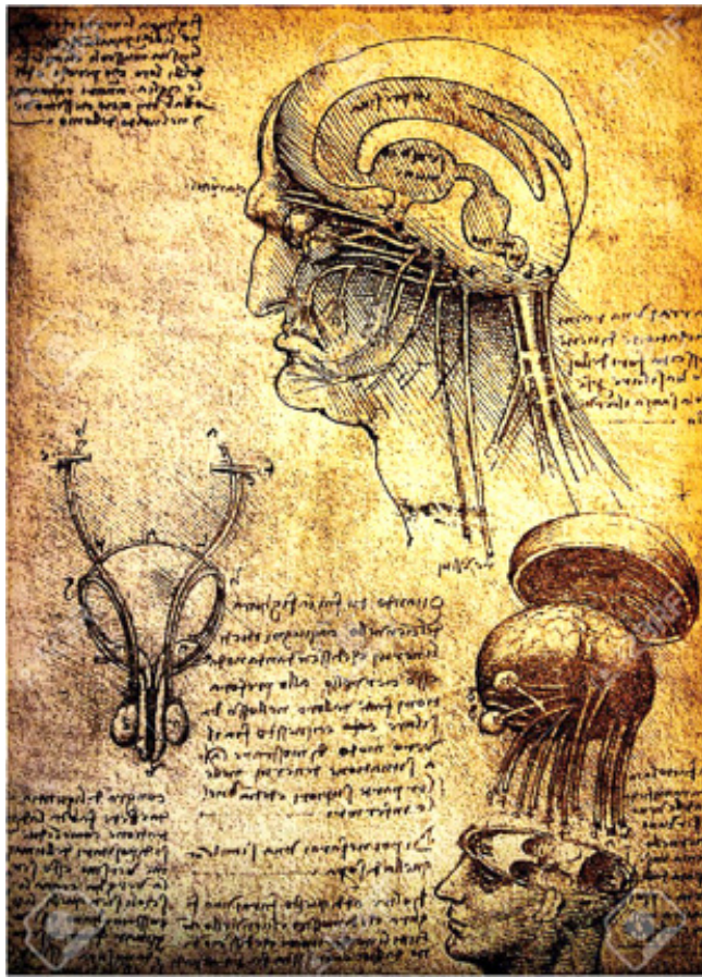
Figure 2. The four encephalic ventricles at the top. Leonardo da Vinci's drawing. Source: (22).

Furthermore, the great anatomist Andreas Vesalius (1514-1564), contemporary of Leonardo, came to conclusions that contradicted established galenic dogmas by means of dissections made in executed criminals. For example, he noted that the structure of the brain was different from that of Galen, and that the brain ventricles did not contain any spiritu , but were filled with a clear fluid, later called cerebrospinal fluid (CSF). References of this clear fluid inside the skull had already been made in the past; in a papyrus dating from the seventeenth century BC, a skull fracture is described in the occipital region with a fluid leak (23).