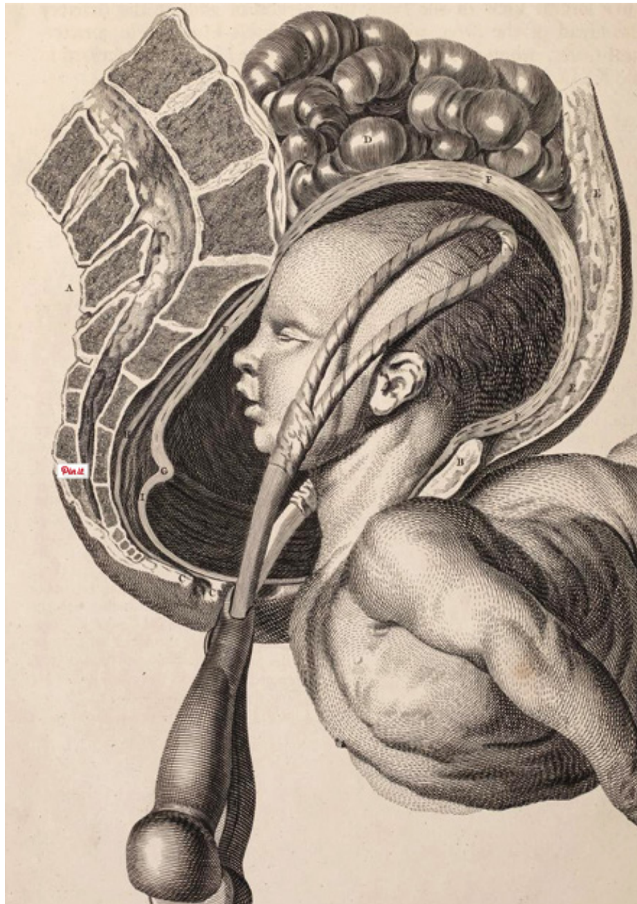
WILLIAM SMELLIE, M.D. (1754) "A Sett of Anatomical Tables with explanations and an abridgement of the Practice of Midwifery"